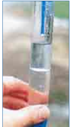
Mix of avgas and water